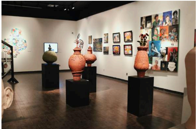
Left Image: Medium: Handbuilt, Terracotta clay, Dried glaze cone 01, and 32x21x21 Inches, 2019