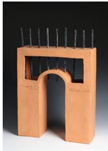
Left Image: Medium: Handbuilt, Terracotta clay, Underglazes and glaze cone 04, 16x19x21x10 Inches, 2019