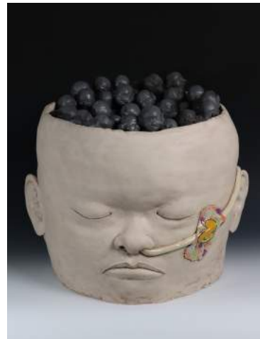
Left Image: "Diagnosed" Medium: Stoneware, Underglaze and glaze cone 5, 24x26x16 Inches, 2019 Right image: "Death", Stoneware, Underglaze and glaze, cone 5, 18x23x19 Inches, 2019