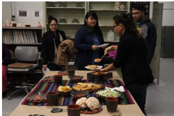
Performance, Ceramics Vessels and Food, 2017